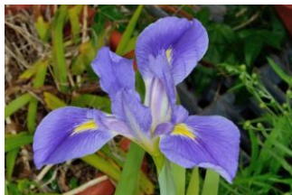
The Louisiana Iris